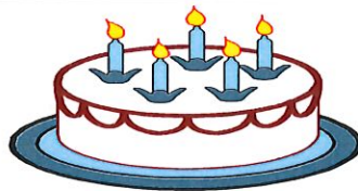
April Mitchell 4/17