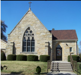
ST. AUGUSTINE CATHOLIC CHURCH REED, KY