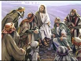
ST. PETER OF ALCANTARA CATHOLIC CHURCH STANLEY, KY