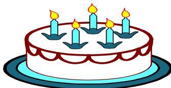
Becky Peerman 7/10