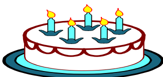
Shelia Byrne 8/5