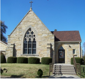
ST. AUGUSTINE CATHOLIC CHURCH REED, KY