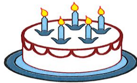
Trevor Weldon 7/15