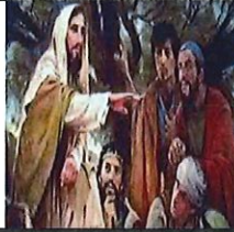
ST. PETER OF ALCANTARA CATHOLIC CHURCH STANLEY, KY