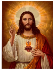
June is the Month of The Sacred Heart