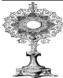
April is the Month of the Blessed Sacrament