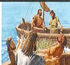
ST. PETER OF ALCANTARA CATHOLIC CHURCH STANLEY, KY