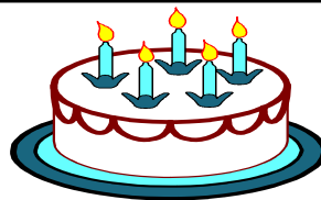
Phyllis Schrecker 12/10