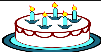
Vicky Riley 1/30